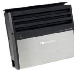
PA-2100 : 2-Channel Power Amplifier