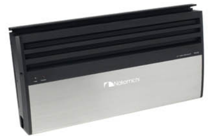
PA-4100 : 4-Channel Power Amplifier

*Dimensions do not include protruding parts. Specifications and design are subject to change for further improvement without notice.