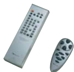
Main and sub remote controls

in the two inactive players at any time. Subtly transparent front panels on each player let you to check disc titles at a glance. The players are fully programmable, both individually and as an ensemble.